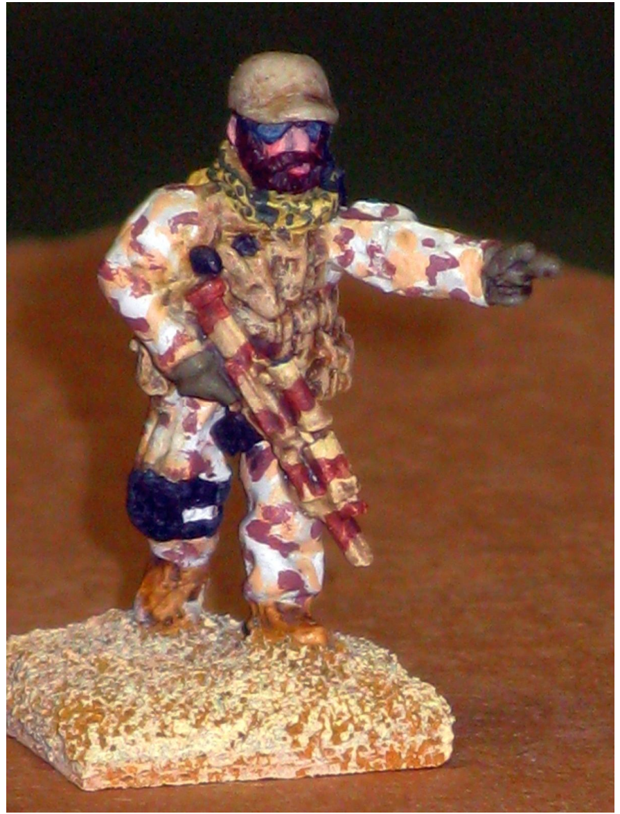
20mm in white metal of Elhiem Figures

The color of the uniforms varies according to wear and exposure to the elements, so do not worry too much about the exact correspondence of colors.